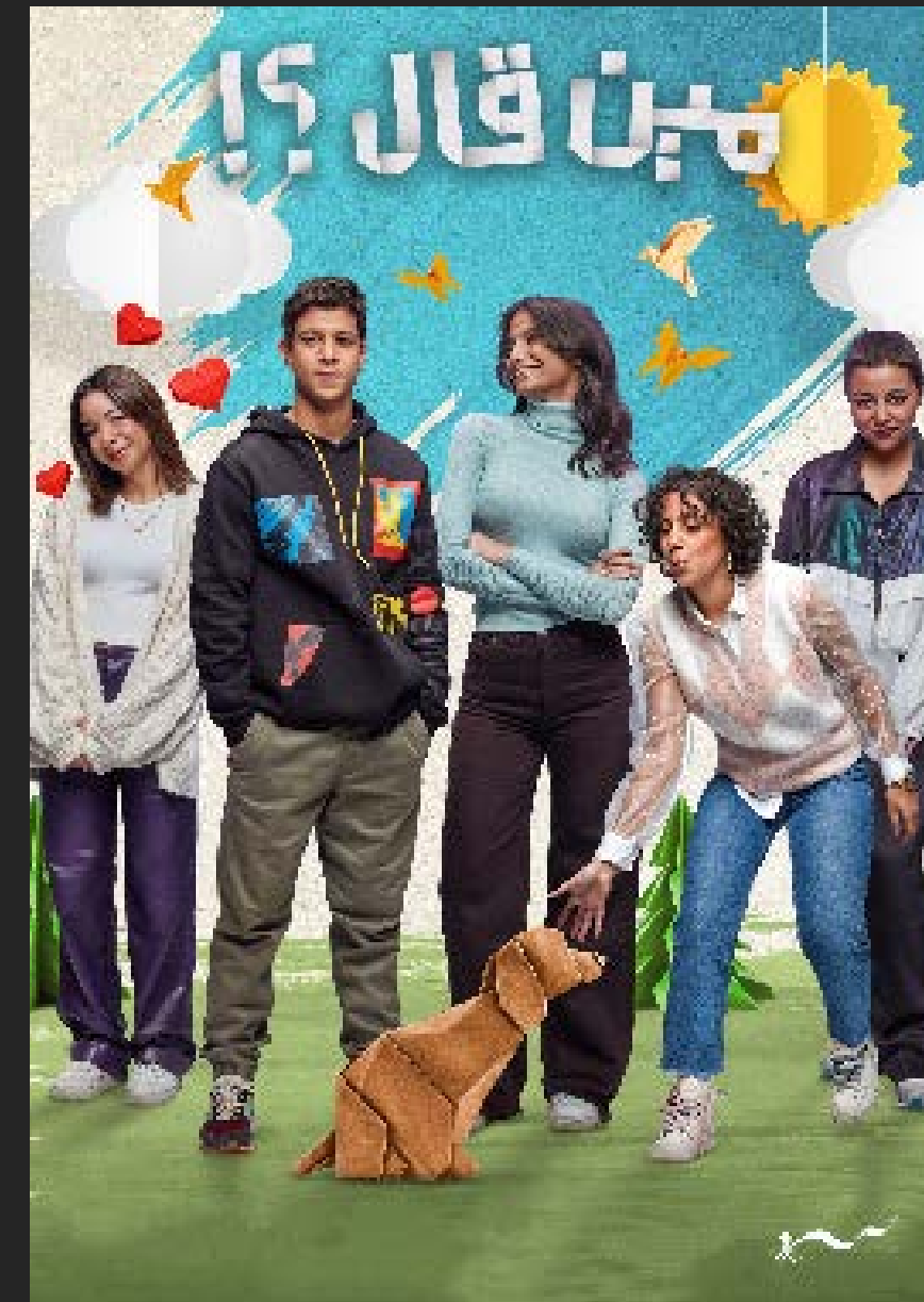
WHO SAID SO?! - 2022