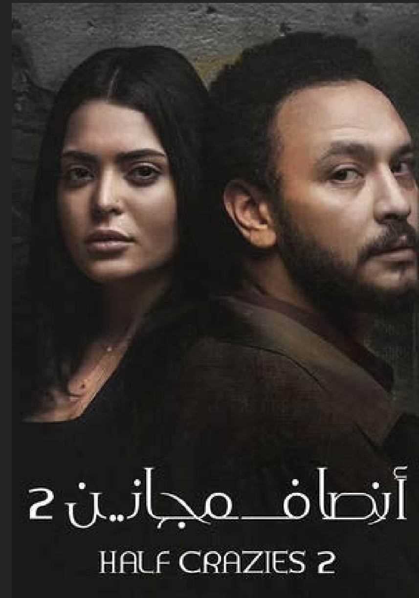
HALF CRAZIES 2 - 2022