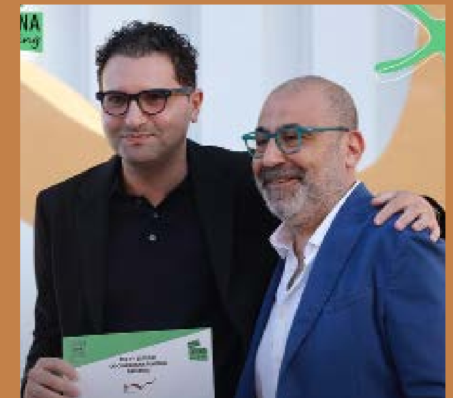
CineGouna Award 2024 Production Grant - Gouna Film Festival 2024