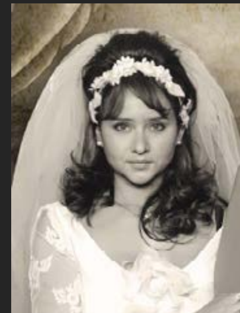
A Girl Named Zat ٢٠١٣

Directed by Kamla Abouzekry Khairy Beshara