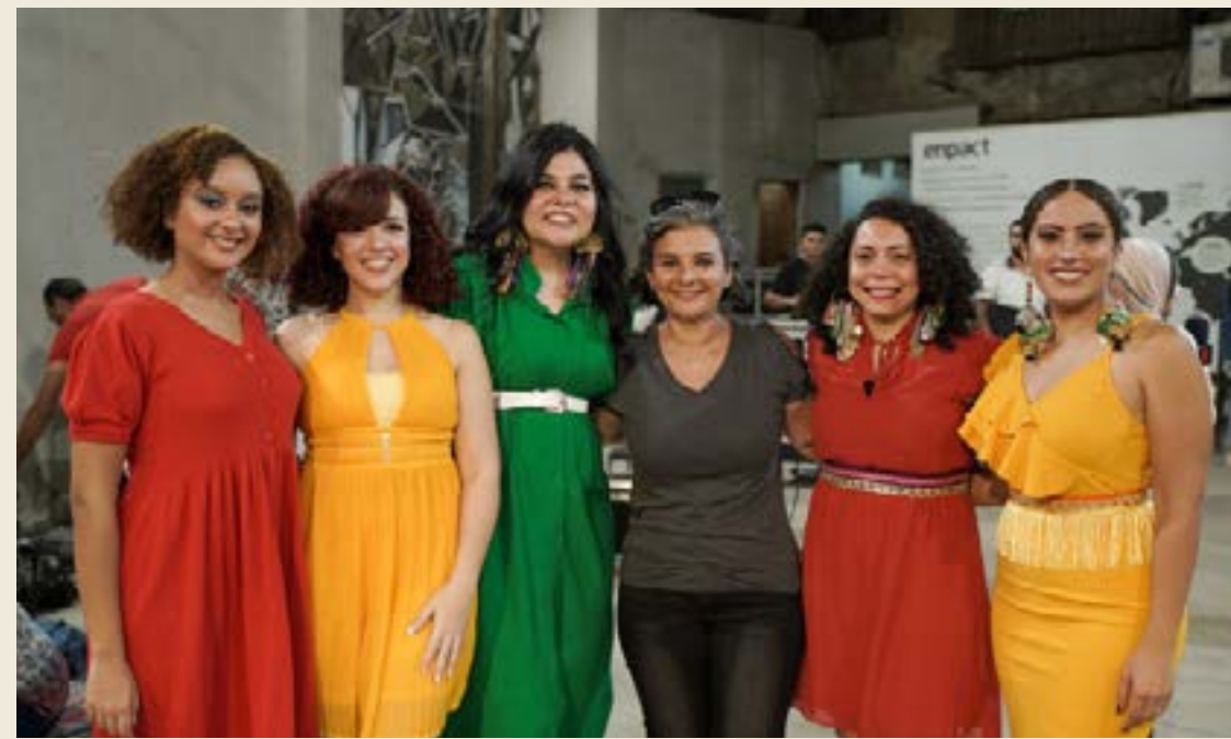
Netflix "Because She Created" ٢٠٢٢