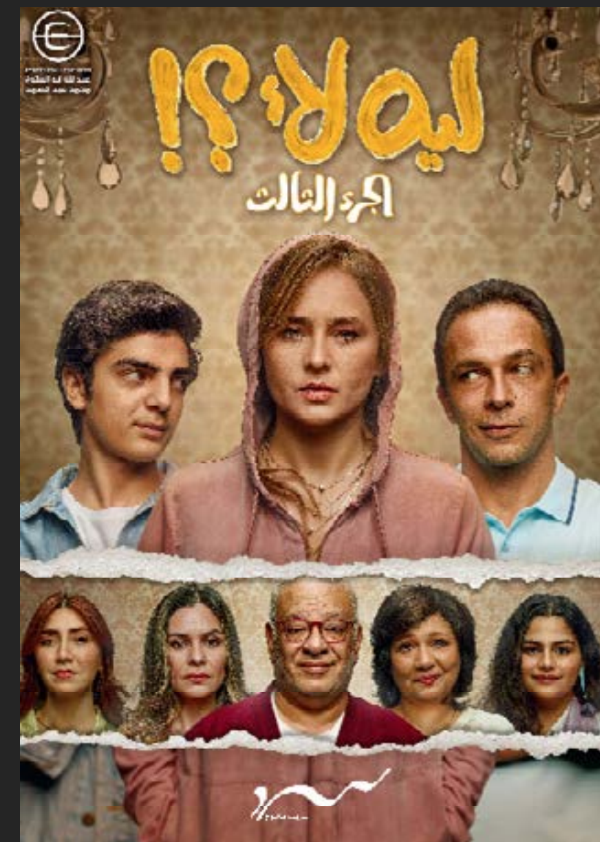
WHY NOT? 3 - 2023