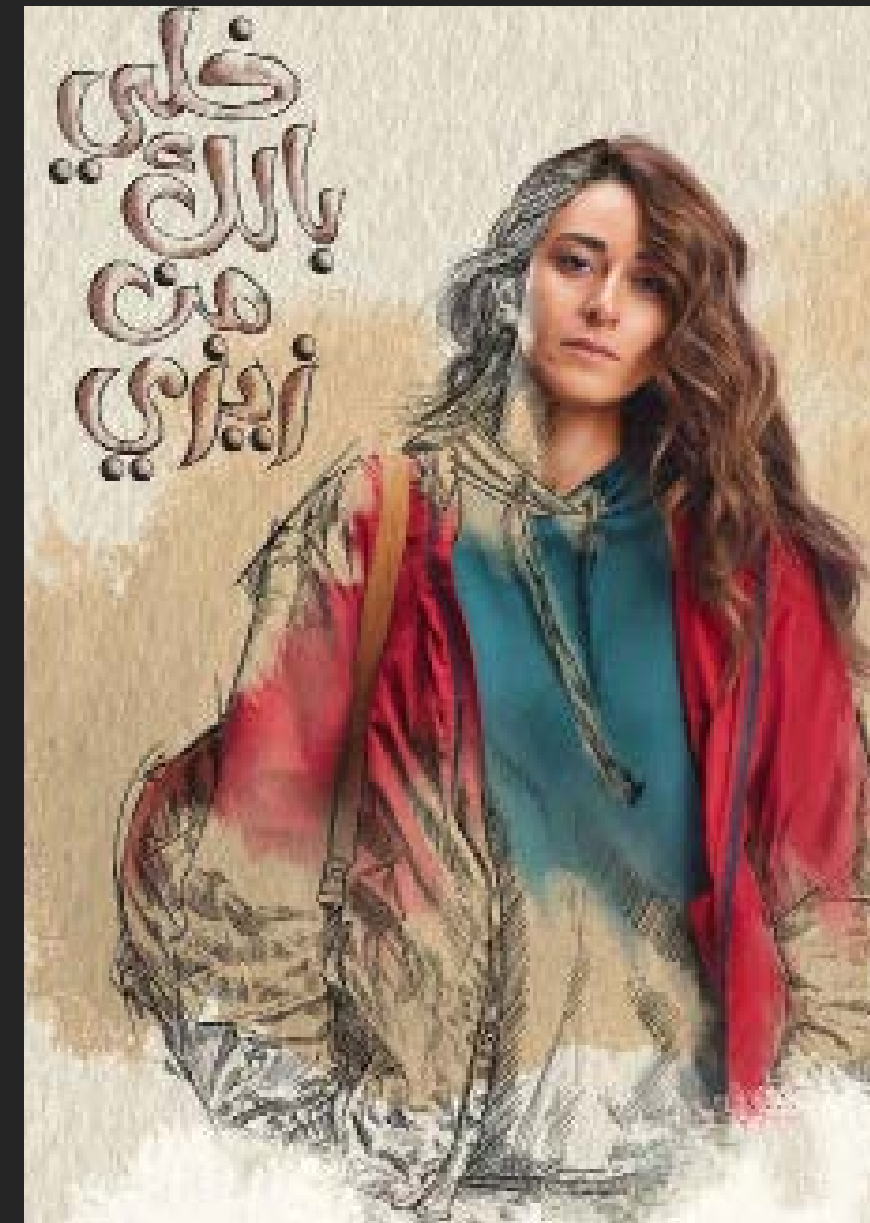
TAKE CARE OF ZIZI - 2021