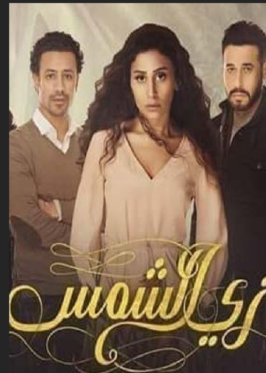
CRYSTAL CLEAR - 2019