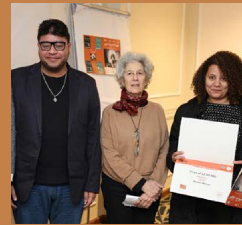
SARD Award 2024 at Ismaelia Film Festival - script consultation.