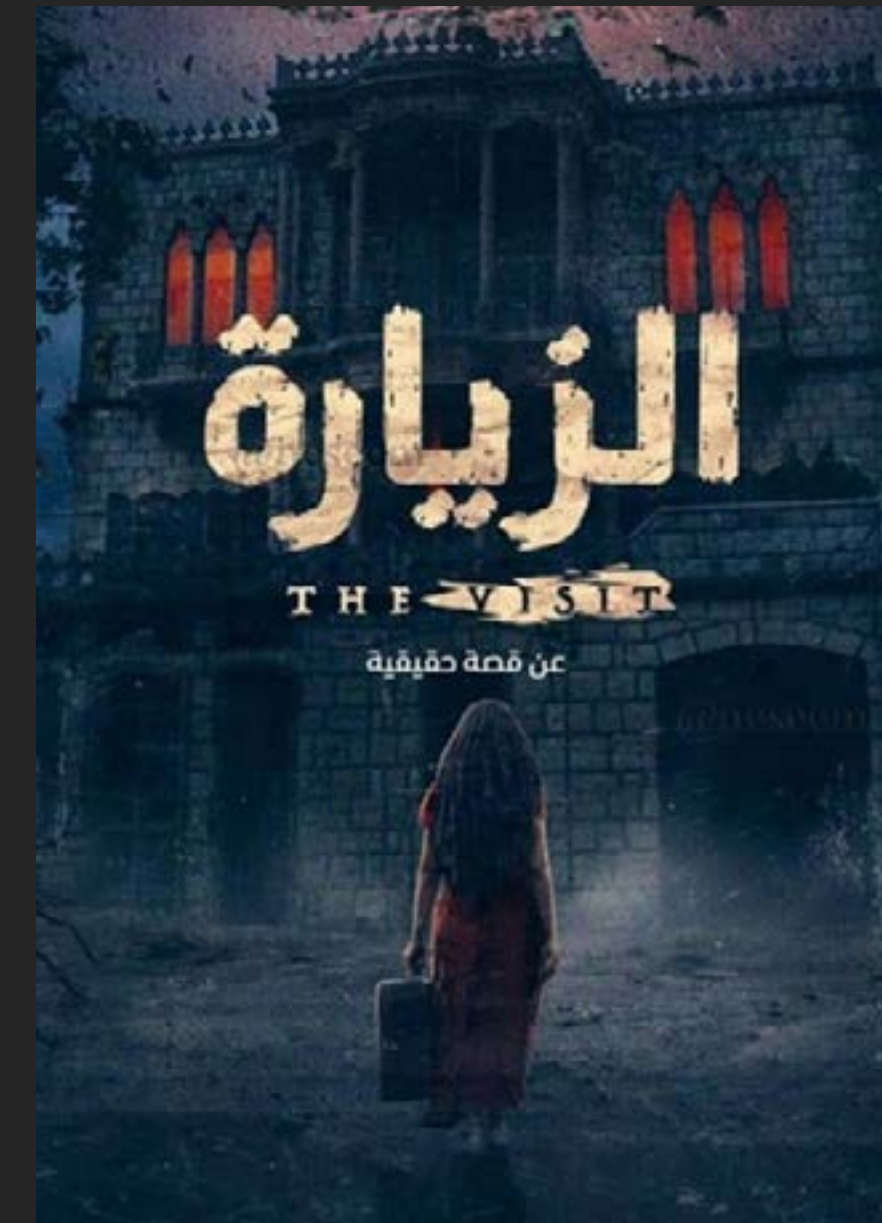
THE VISIT - 2021