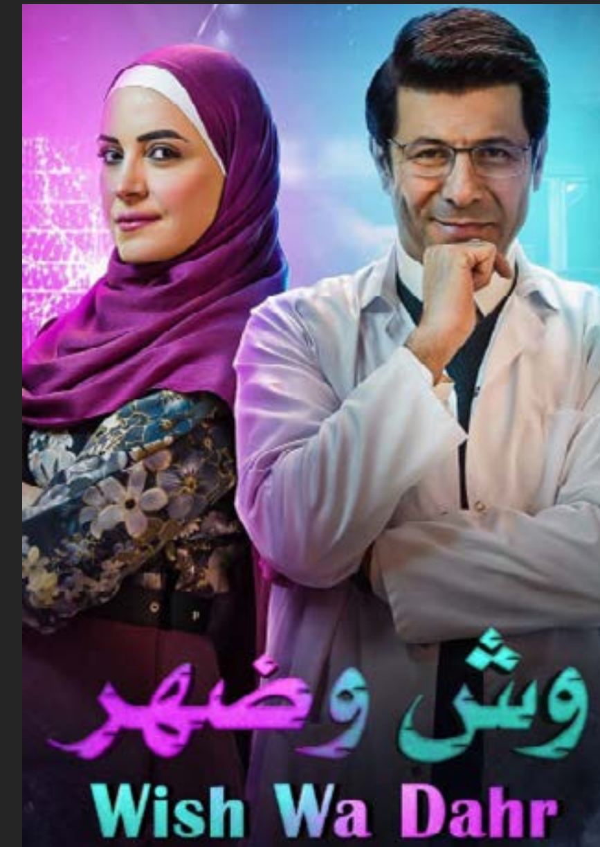
DOUBLE FACED - 2022