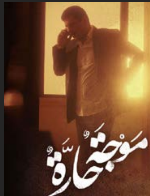
Heat Wave ٢٠١٣