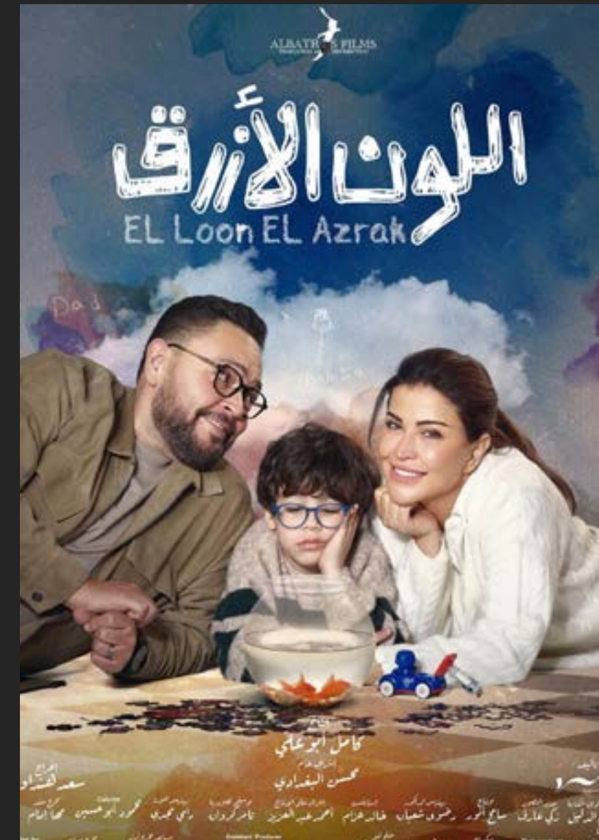
THE COLOR BLUE - 2026