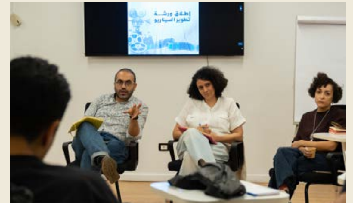
Sard x Sawiris Screenplay Lab ٢٠٢0