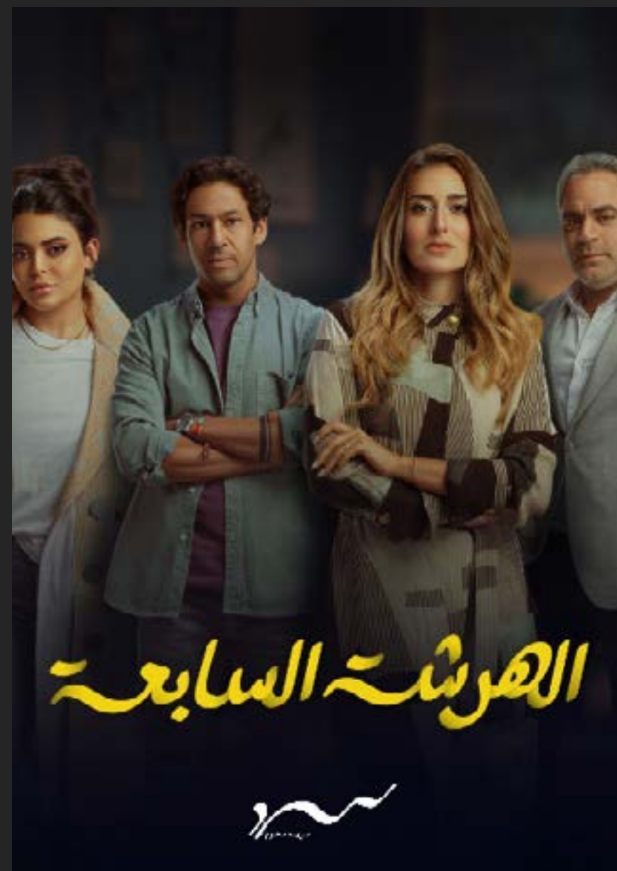
SEVENTH YEAR ITCH - 2023