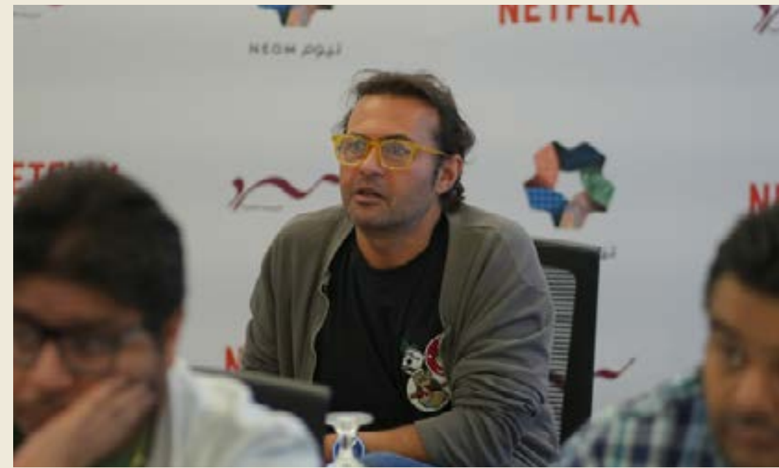
Sard x Netflix Saudi Future Female Filmmakers Program ٢٠٢٤.