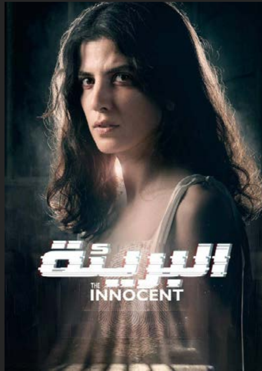
THE INNOCENT - 2021