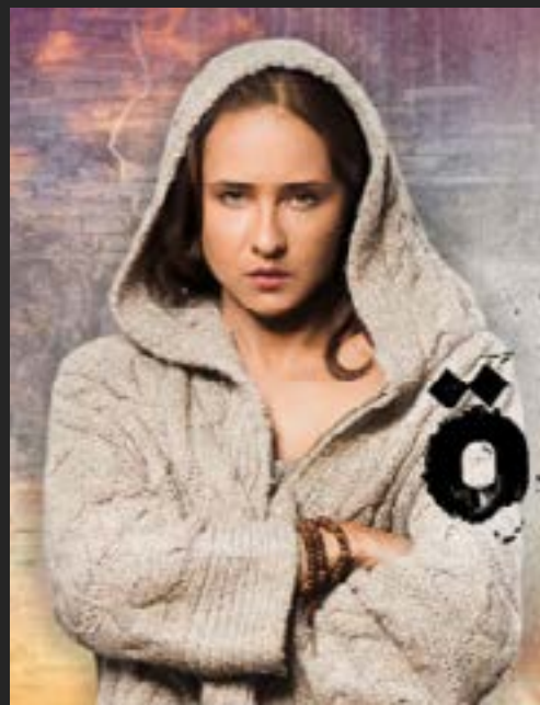
Under Control ٢٠١٥