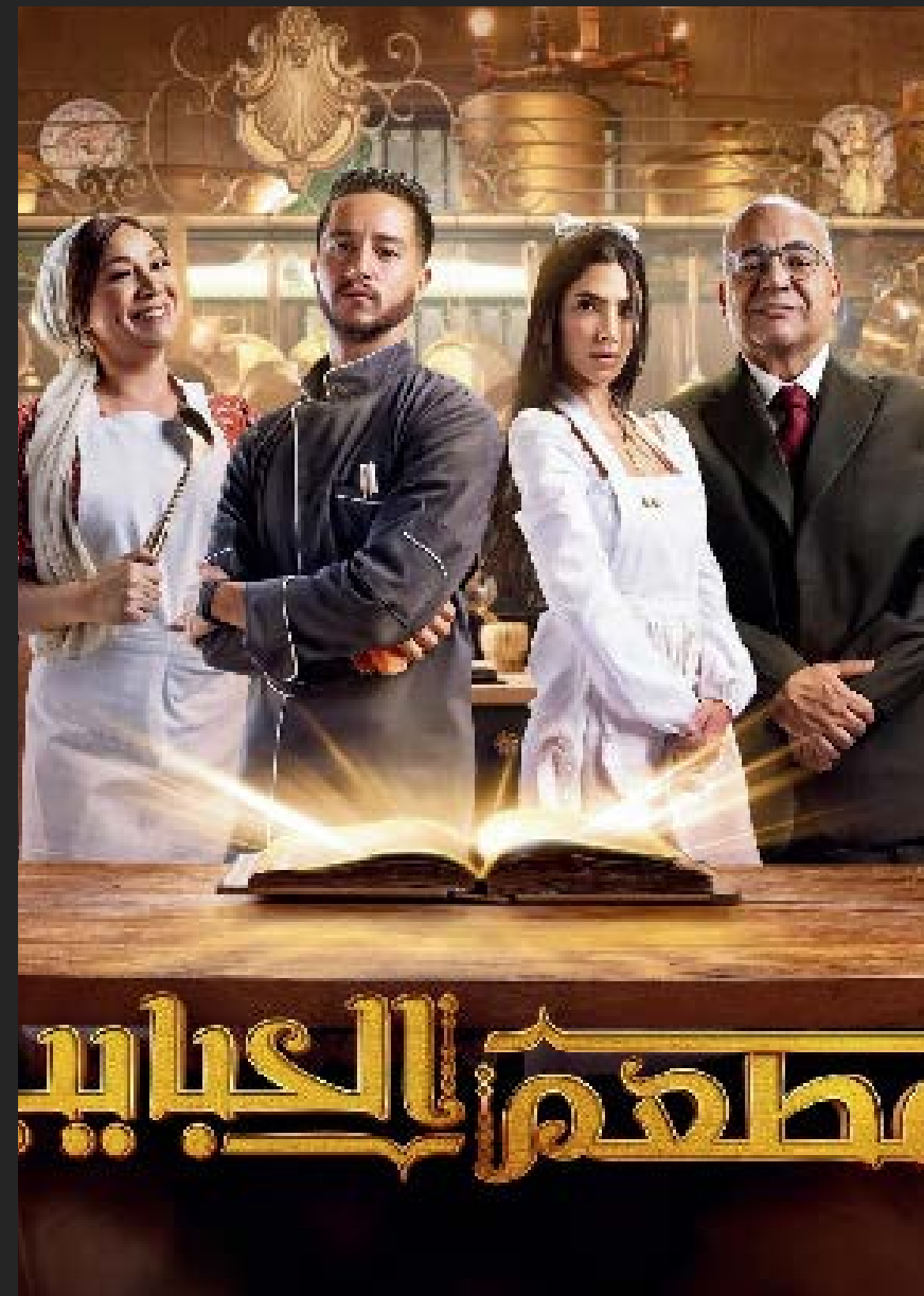
ELHABAYEB RESTAURANT - 2024