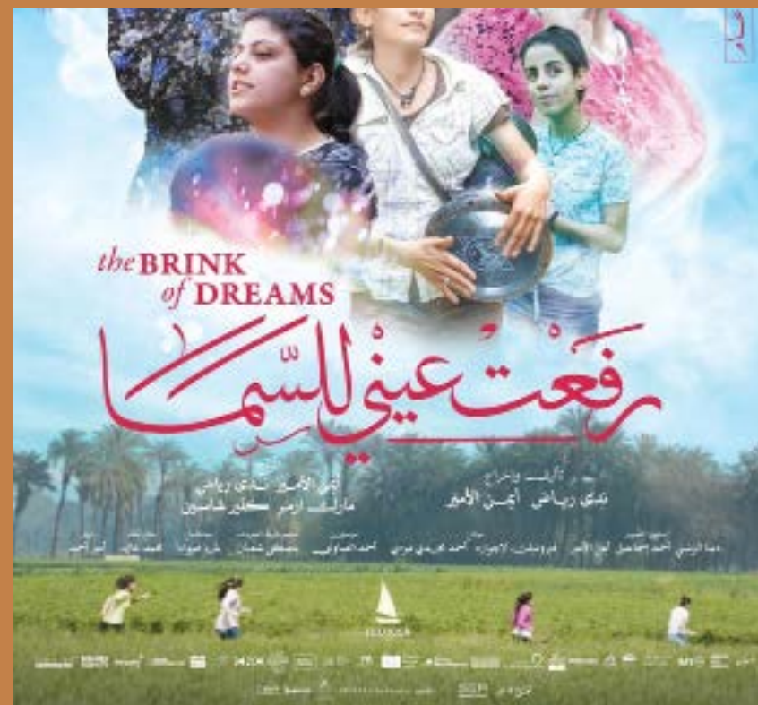
Sard awarded the film at CineGouna springboard - GFF 2023 edition.

This initiative supported the development of award-winning films, including The Brink of Dreams, which won an award at the Cannes Film Festival, 0· Meters, and other prominent projects.