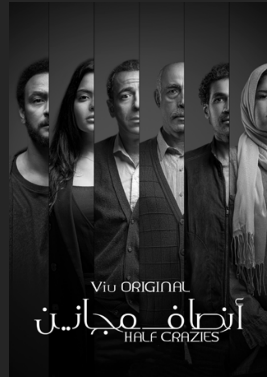
HALF CRAZIES - 2021