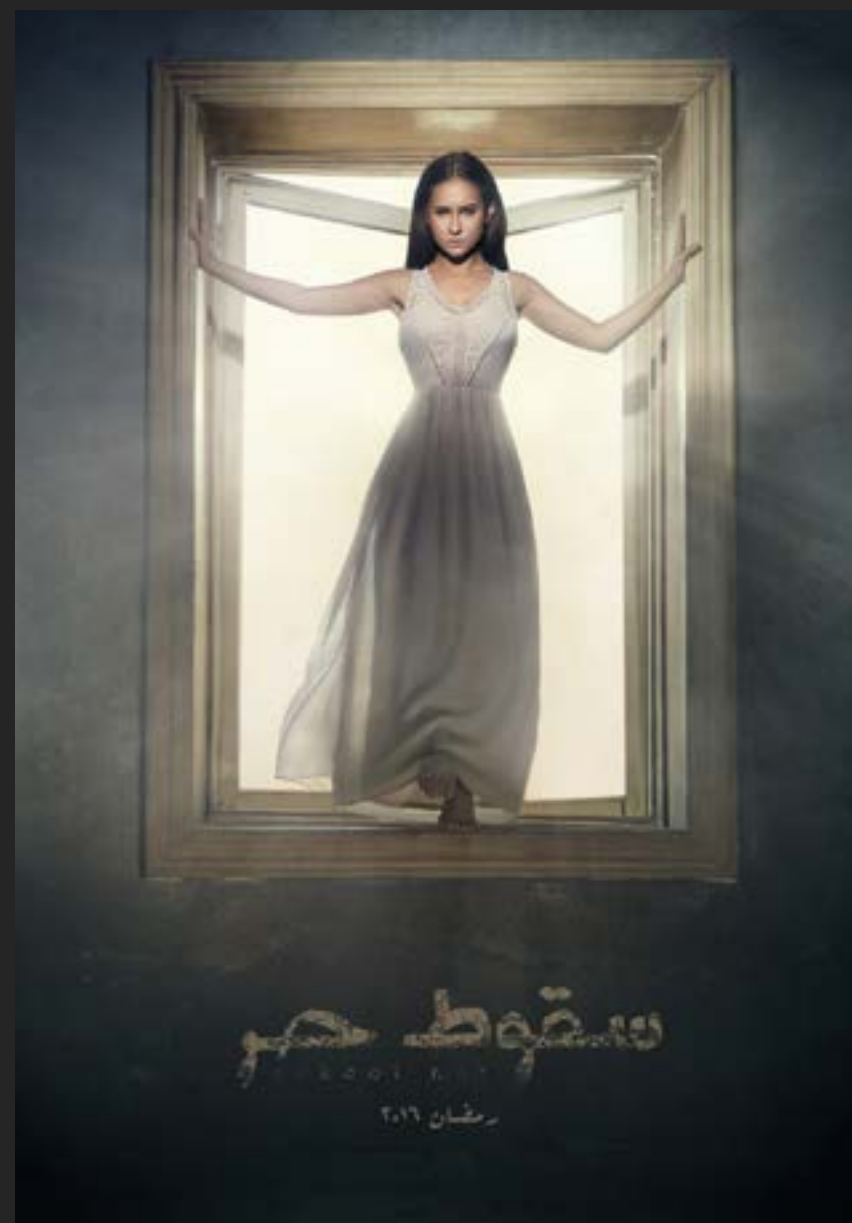
FREE FALL - 2016