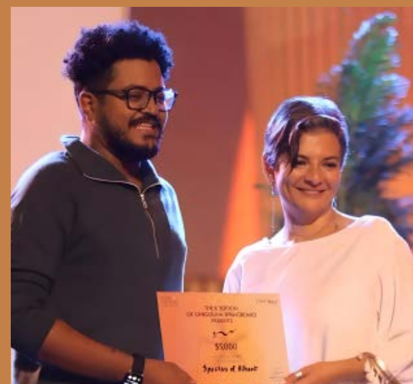
CineGouna Award 2023 Script Development.