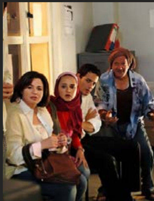
One - Zero ٢٠٠٩

This document includes interactive posters. Click on any poster to be redirected to the project's trailer.