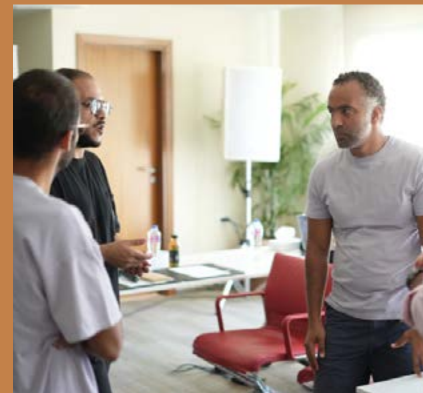
Shots Lab - Sard x El Gouna 2024