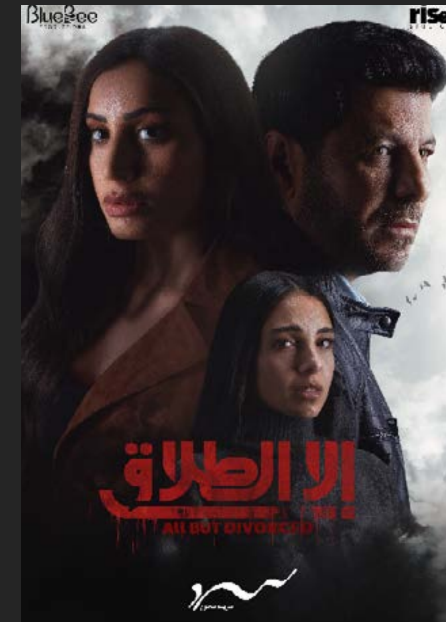
ALL BUT DIVORCE - 2024