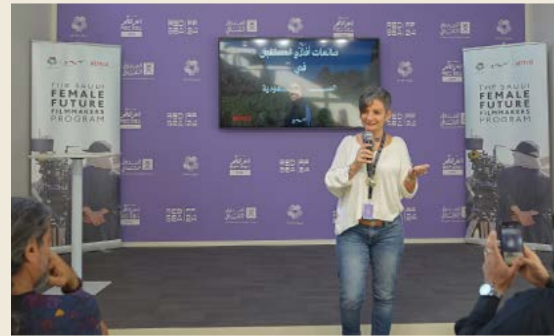
Saudi Arabia's Female Filmmakers of the Future with Netflix and NEOM.