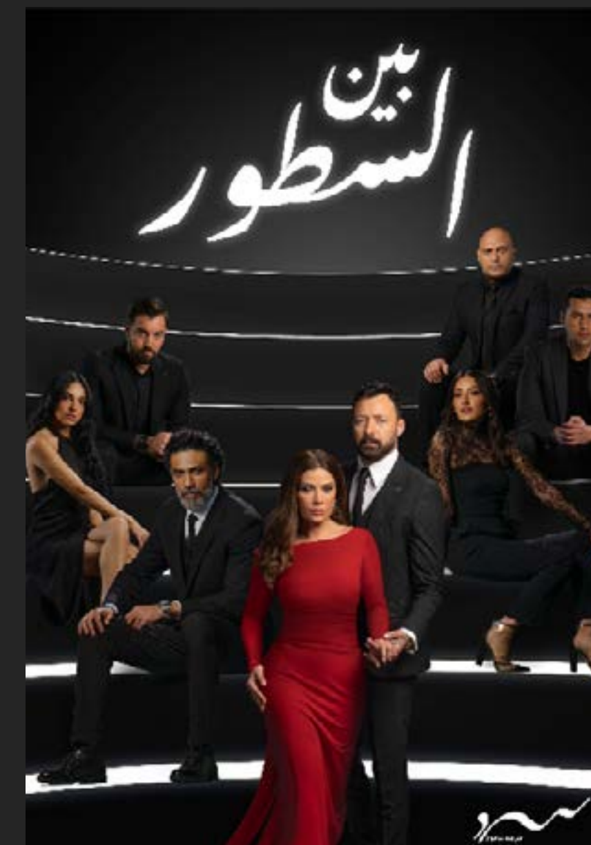
BETWEEN THE LINES - 2024