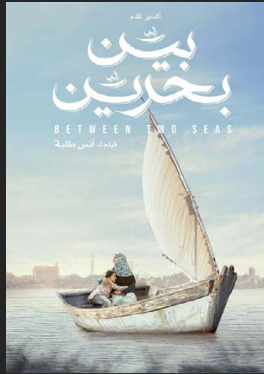
BETWEEN TWO SEAS - 2018