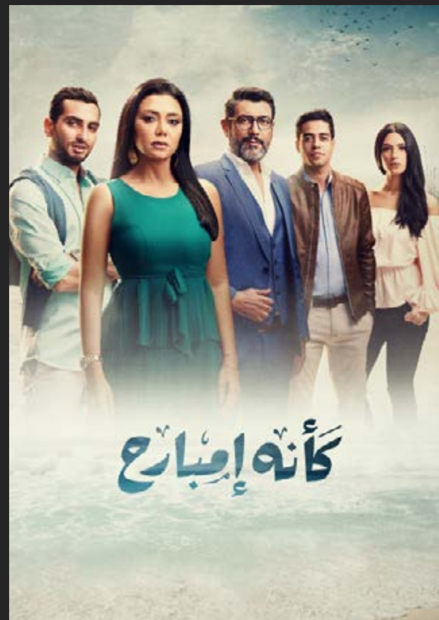
LIKE IT WAS YESTERDAY - 2018