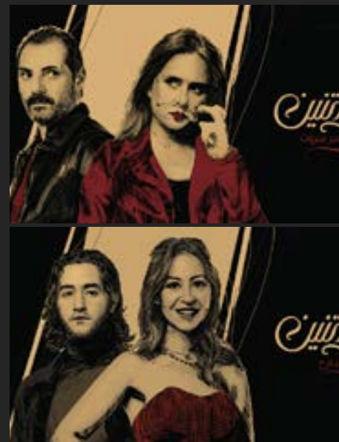
٣ Episodes in Number ٢ Series ٢٠٢٠