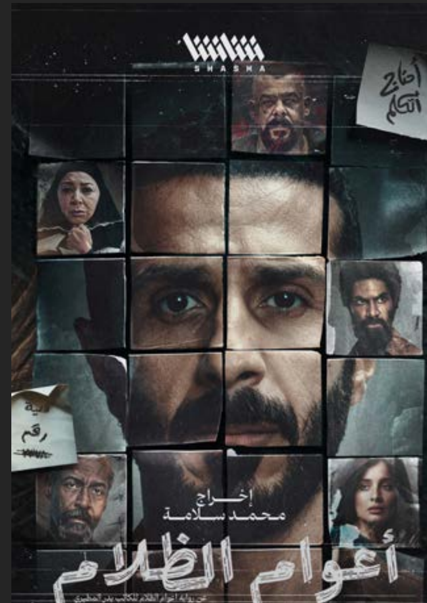
YEARS OF DARKNESS - 2026