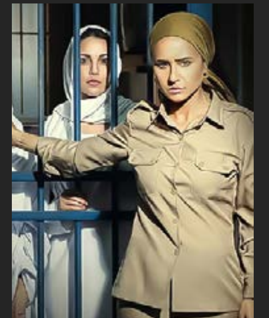
Women's Prison ٢٠١٤

Directed by Kamla Abouzekry Khairy Beshara