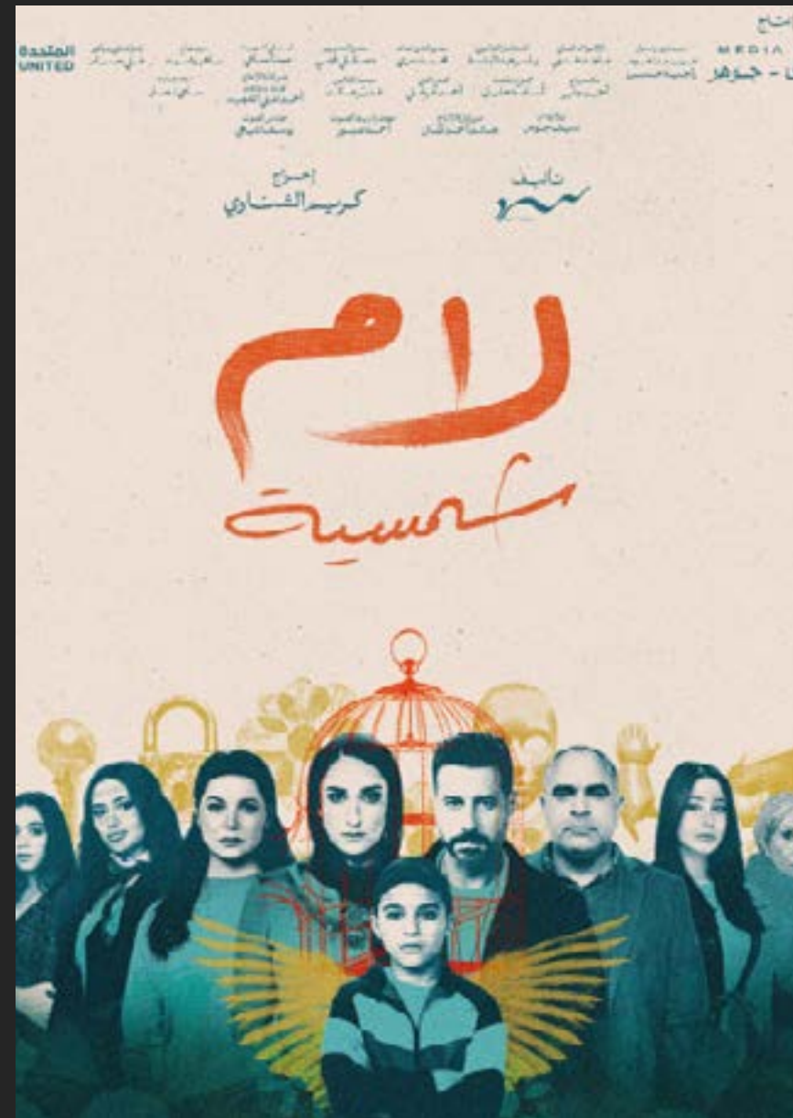
SILENT LETTER - 2025