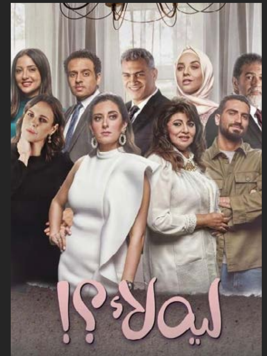
WHY NOT? - 2020