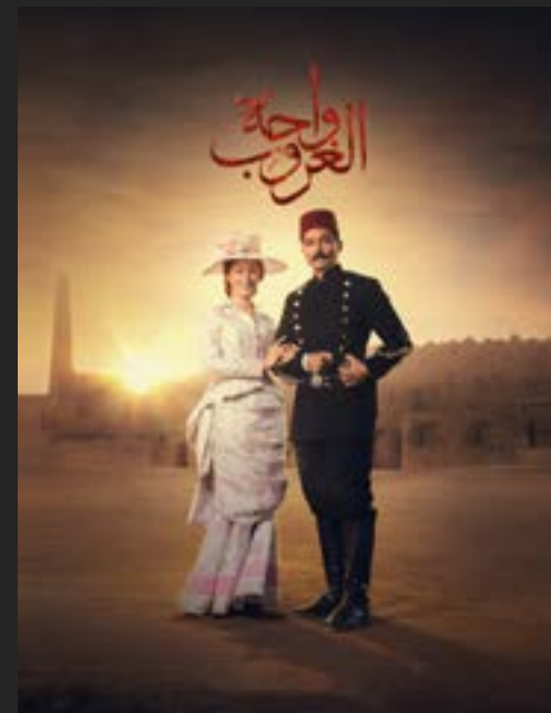
Sunset Oasis ٢٠١٧